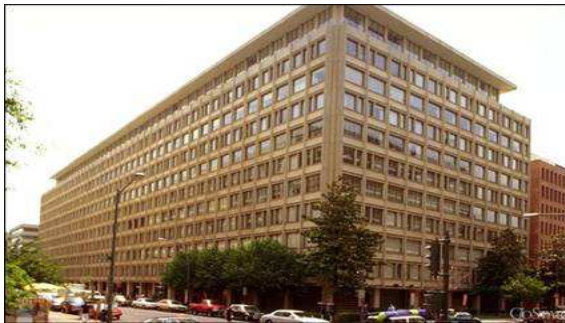
1800 G STREET, NW